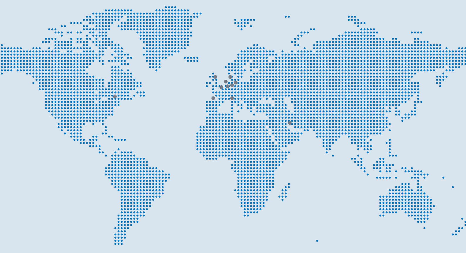
Amsterdam - Dubai - Frankfurt - Geneva - Zurich - Madrid - Milan - New-York