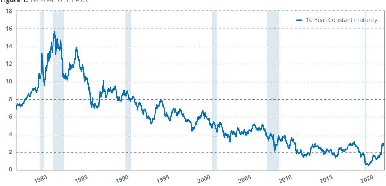
Figure 1: Ten-Year UST Yields

Refresh your memory with four decades of declining US Treasury yields, if you have been investing that long. We all know this has been the driver of financial assets throughout our adult lives. How are you changing your investing approach?